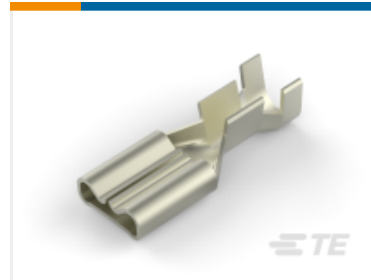
TE Part # 2238198-3 187 FASTON,REC.,20-16 AWG,TPBR