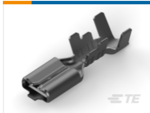
TE Part # 2238174-3 187 FASTON,REC.,24-14 AWG,TPBR